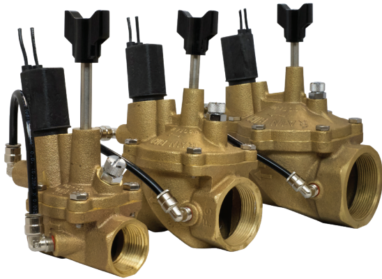
EFB-CP Series Valves

Electric remote control valves don't come any better than EFB-CP Series valves, which are reclaimed ready in order to handle the harsh conditions in non-potable water situations. Need a contamination-proof, self-flushing screen that cleans itself and resists debris build-up in dirty water? The EFB-CP's the one! Rain Bird brass valves offer long life and superior performance in high pressure applications.